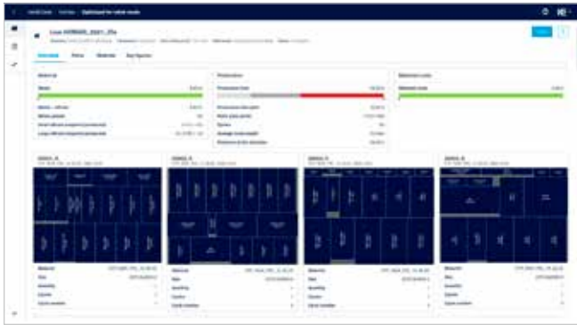
Detailed production data