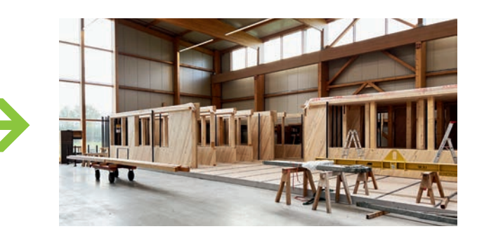
After: The wall elements can be positioned and aligned in a quick and easy way.

Before: The wall units are temporarily fixed to the room in a freestanding position. The assembly of the wall elements and the exact alignment for the window installation takes a lot of time and effort.