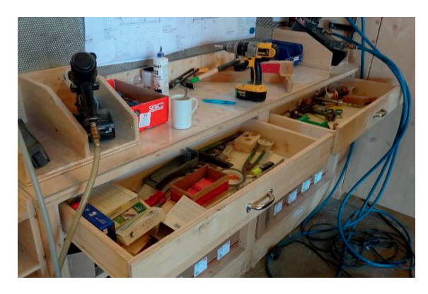
Before: Time spent searching for tools and/or materials is not only inconvenient, but also detracts workers from the job at hand.

Thanks to the reorganisation, you no longer have to waste time looking for tools and materials. Everything is at your fingertips!