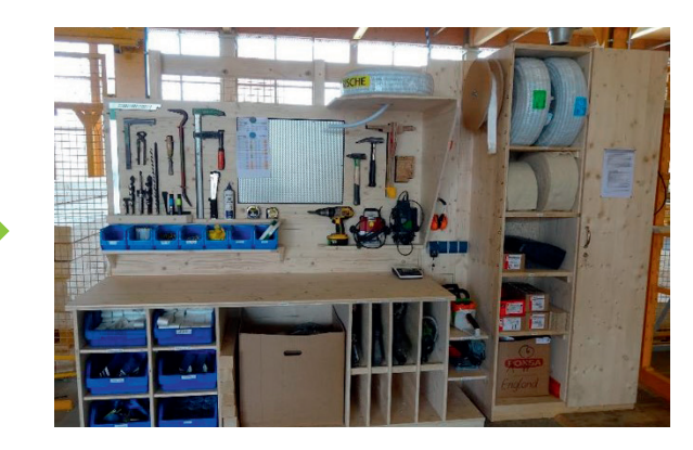
After: Everything is in place. The required tools are always at hand.