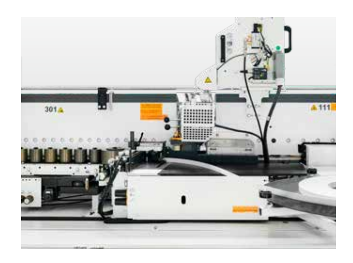
Gluing unit: Reliable hot melt glue application and perfect edge quality are provided by optimum combined workpiece preheating, Quickmelt application unit, pre-melting unit, magazine and pressure zone.