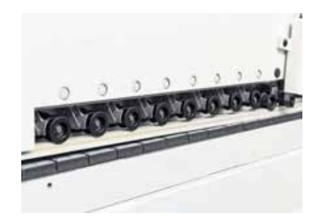
Belt-type top pressure: top pressure beam made of steel ensures that workpieces are ideally clamped for processing.