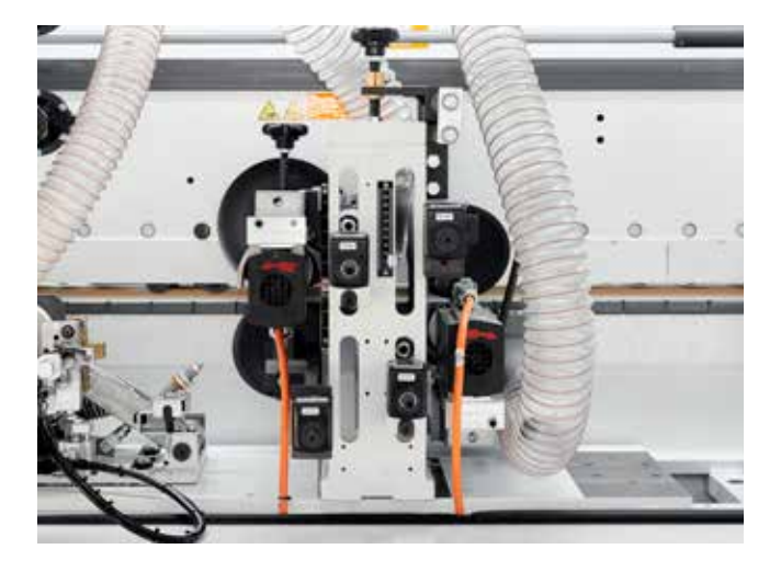
Chamfer/radius trimming unit: This 2-point adjustment trimming unit is ideal for rapid changes between thin and thick edges.