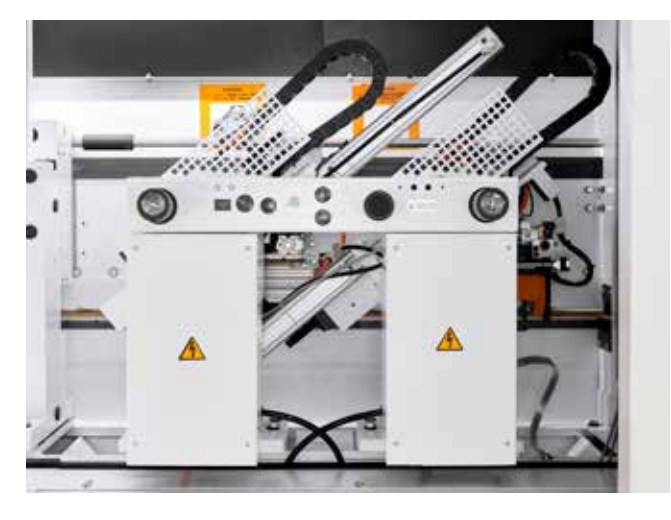
Snipping unit: With exact cuts the face side can be snipped either straight or with chamfer.