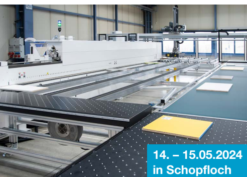
14. – 15.05.2024 in Schopfloch