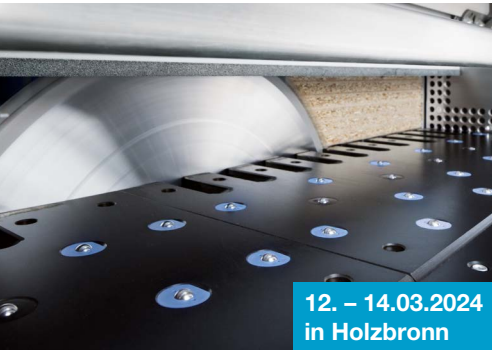
12. – 14.03.2024 in Holzbronn

Immerse yourself in the latest machine technology, complemented by innovative digital solutions designed to make your day-to-day work easier and more efficient.