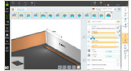
When the parameter is selected, the dimensioning is displayed on the workpiece.