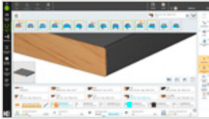
The workpiece program with just a few clicks.