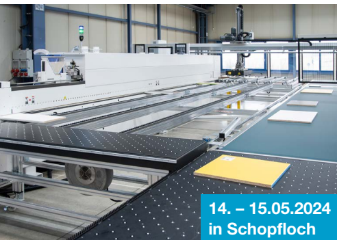
14. – 15.05.2024 in Schopfloch