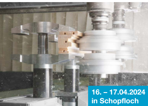
16. – 17.04.2024 in Schopfloch