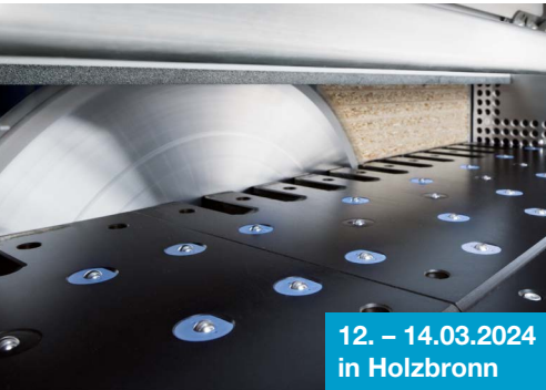
12. – 14.03.2024 in Holzbronn

Immerse yourself in the latest machine technology, complemented by innovative digital solutions designed to make your day-to-day work easier and more efficient.